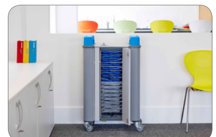
TabCabby 16H Compact